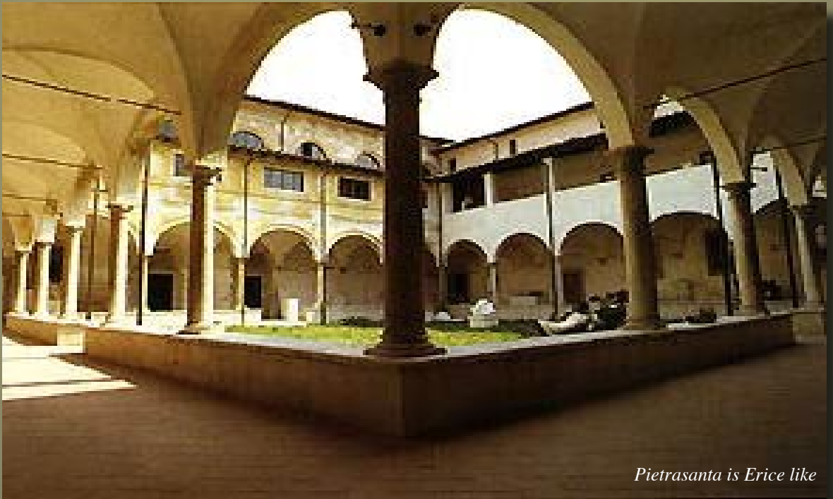
Pietrasanta is Erice like

Heroin Addiction. The Clinical and Therapeutic aspects. 6th Italian National Conference