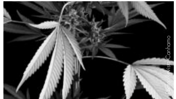
Indoor cultivation of herbal cannabis now occurs in most, if not all, European countries but imported products are still more commonly used.

Indoor cultivation of herbal cannabis now occurs in most, if not all, European countries but imported products are still more commonly used. Herbal cannabis grown hydroponically in the EU is overall consistently of high potency, often two or three times greater than herbal cannabis imported from countries of North Africa, the Caribbean, and the Far East (where it is grown naturally outdoors and where storage and transit time degrade the THC). Although in many EU countries some intensive home production of cannabis now occurs, the market share of this type of the drug is thought to be small, but there are concerns that it might be growing, highlighting a need for better